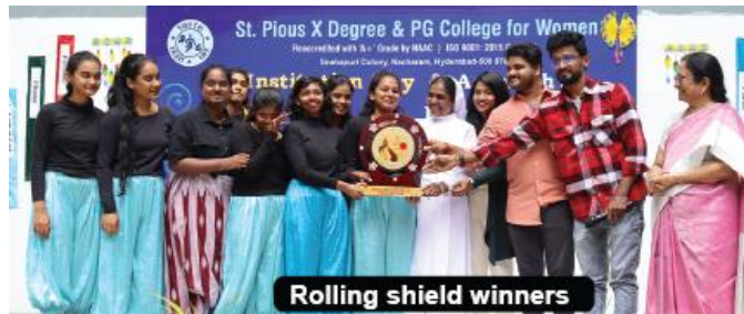
Rolling shield winners